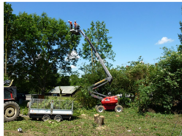
Fig. 3 Removal of trees with the aid of a Mobile Elevated Working Platform

In July 2015, a leaflet drop to 11,000 addresses with local Paddock Wood postcodes was undertaken (Fig. 5). This aimed to raise awareness more widely and to ask the public to look for and report any emergent beetles. Early