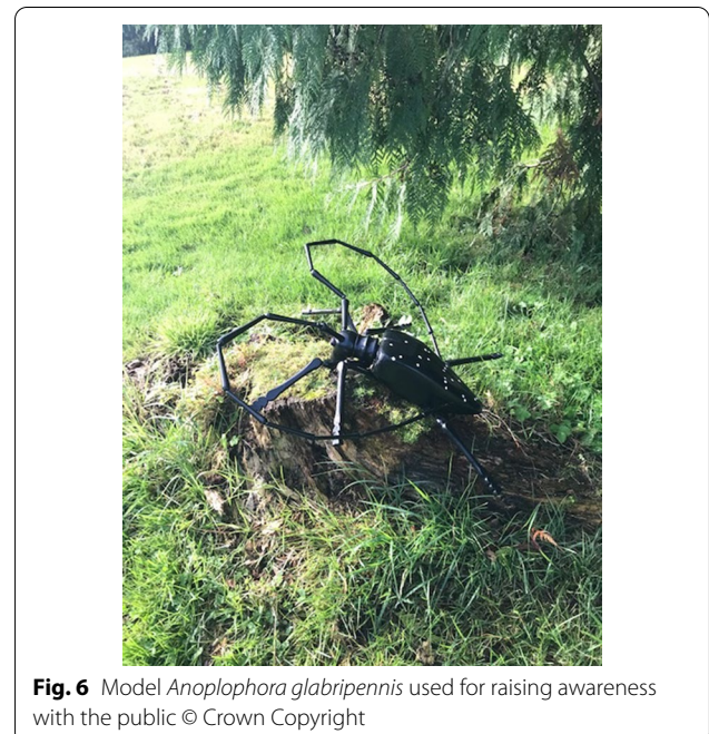
Fig. 6 Model Anoplophora glabripennis used for raising awareness with the public