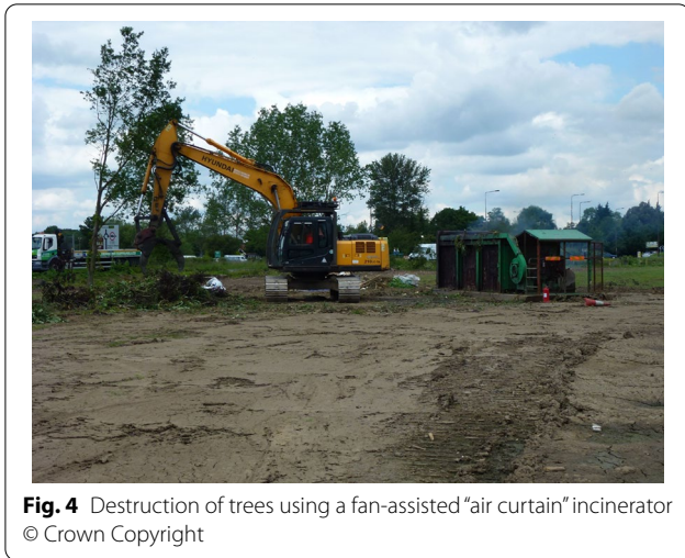
Fig. 4 Destruction of trees using a fan-assisted “air curtain” incinerator

blocks, together with a large model A. glabripennis were commissioned and obtained (Fig. 6). Sectioned wood specimens saved from the initial felling were used to train tree climbers and refresh inspectors from other regions who worked at the outbreak site for short periods. In addition to information on government websites a photographic field guide to A. glabripennis and A. chinensis was produced as part of the Observatree citizen science project and has now been updated (Observatree 2018). A guide to distinguishing the signs and symptoms of Anoplophora from native wood boring species was also developed (Malumphy et al. 2012).